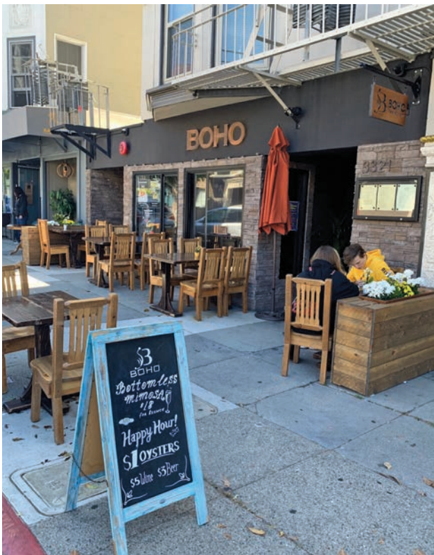
Boho is a popular outdoor dining option.