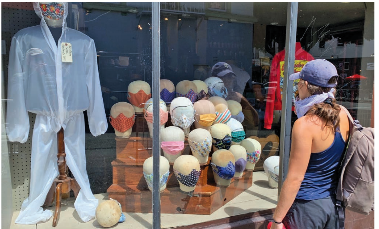
A woman window shops at Al's Attire on Grant Avenue in North Beach.