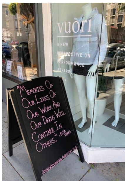
Vuori on Union Street shares words of wisdom.