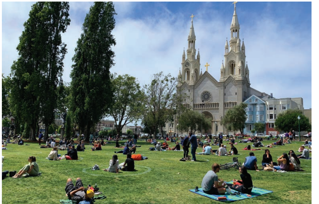
Parkgoers enjoy Washington Square Park on a sunny day.