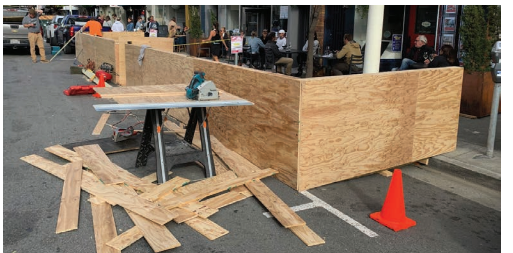
Cultivar's builds outdoor seating.