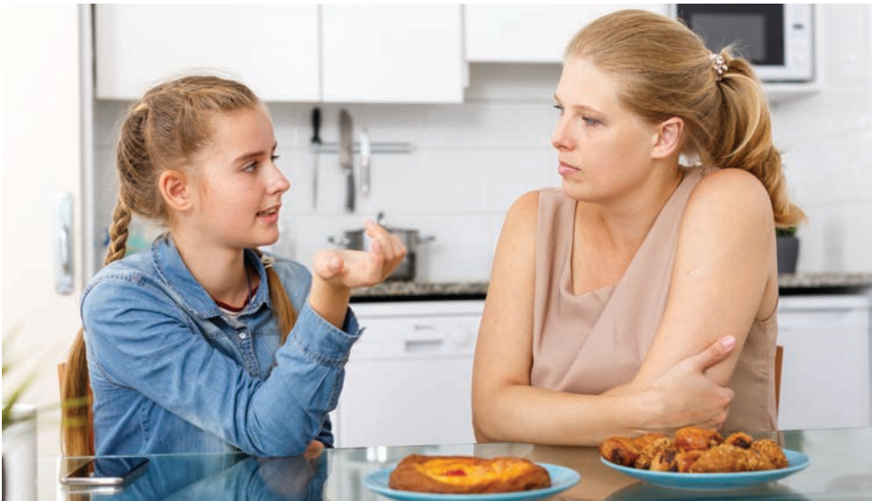
It is important to have ongoing conversations with your children about complicated issues.

easy answers; it is a complicated problem with a long history, but here are some simple ways we can start: