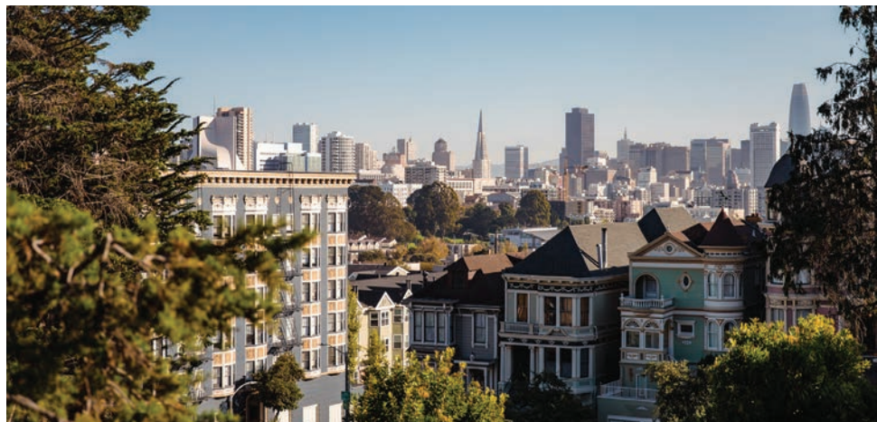
Although home sales are down this year in San Francisco, prices have remained stable.