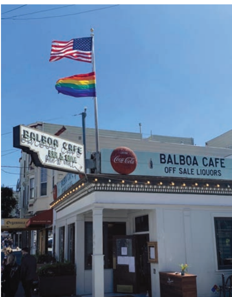
Balboa Cafe has reopened for outdoor service.