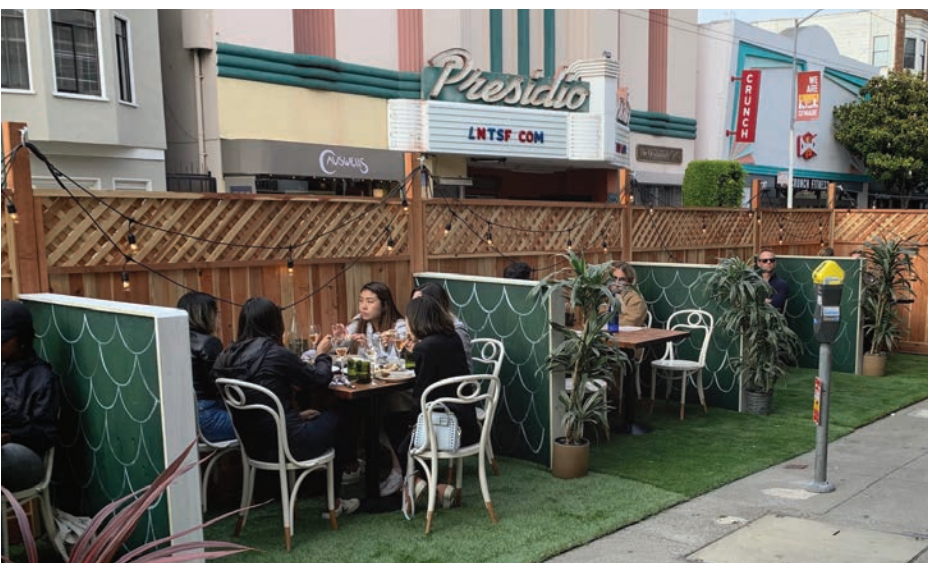
The outside seating at A16 is separated by partitions.