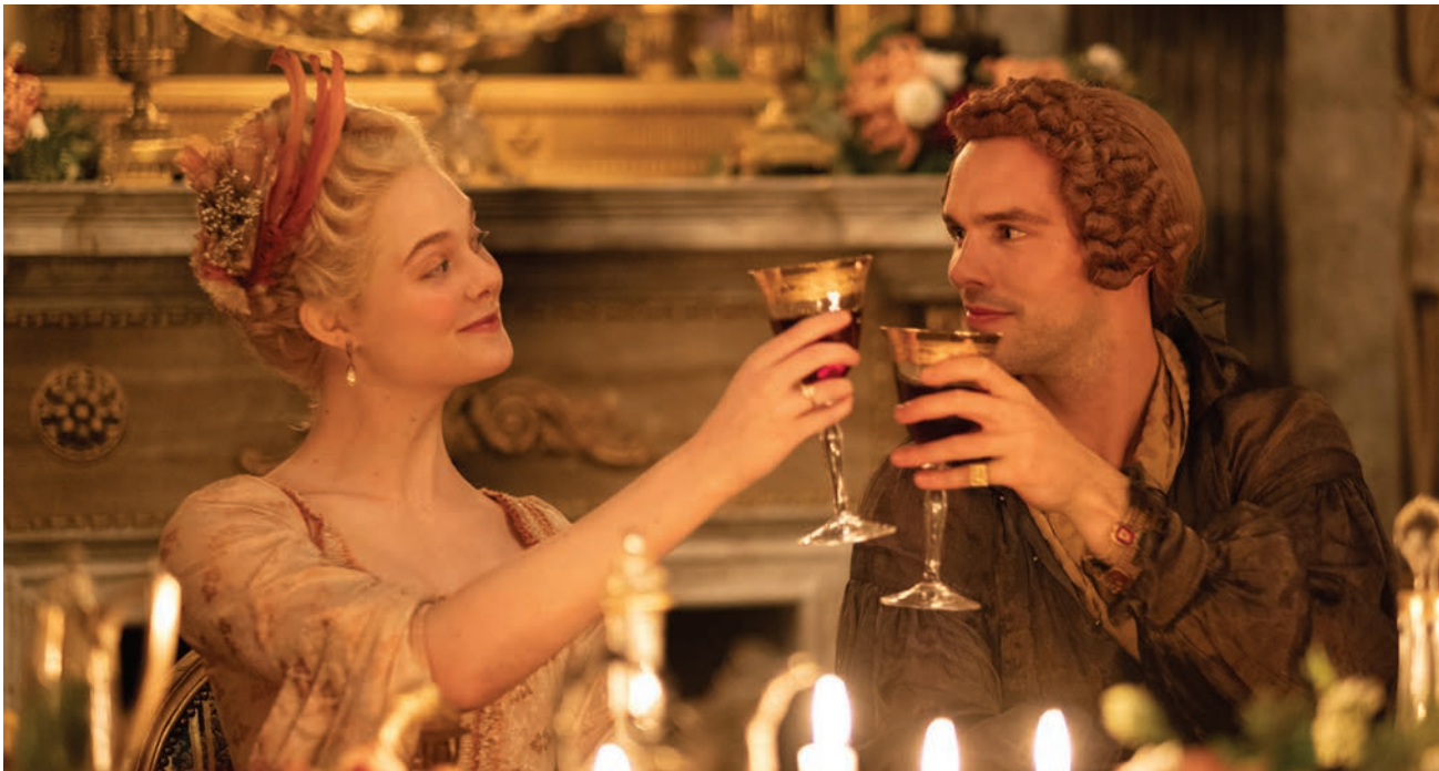
Elle Fanning plays Empress Catherine and Nicholas Hoult plays Emperor Peter III in The Great, now available for streaming on Hulu.

MARINATIMES.COM :: CELEBRATING OUR 36TH YEAR :: VOLUME 36 :: ISSUE 7 :: JULY 2020