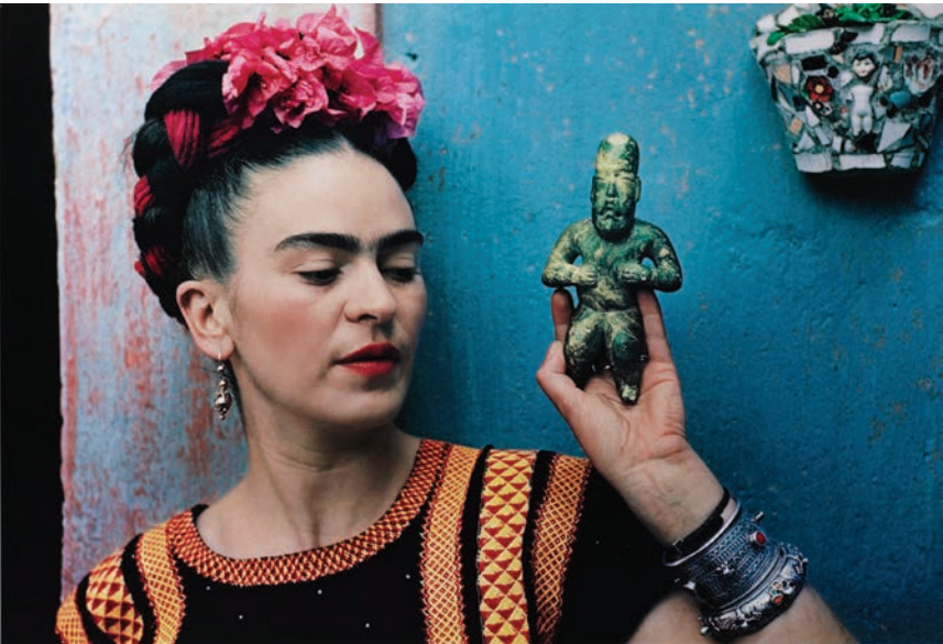
Nickolas Muray's Frida with Olmeca Figurine, Coyoacán, 1939 .