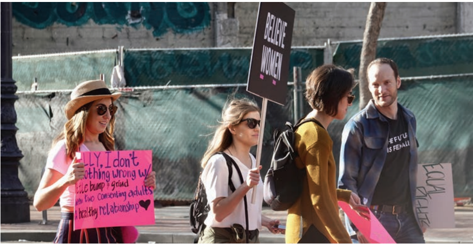
Chesa Boudin at the Women's March.