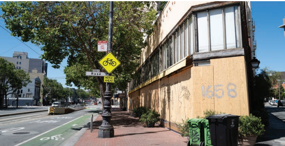
The mayor hopes to spur small business recovery with a new ballot measure.