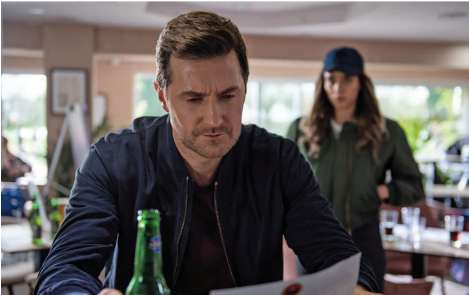
Adam Price (Richard Armitage) is approached by a mysterious woman (Hannah John-Kamen) in The Stranger.

At the center of the story is lawyer Adam Price (Richard Armitage) who learns some upsetting information about his wife, Corinne (Dervla Kirwan), from a stranger (Hannah John-Kamen). Corinne disappears shortly thereafter. Over the course of Adam's search for Corinne and a concurrent police investigation into an