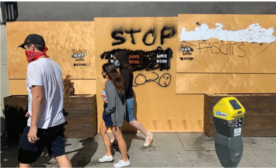
Boarded storefronts become message boards on Polk Street.