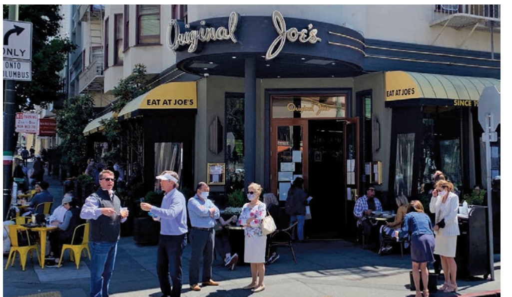
Original Joe's contributes to the revitalization of North Beach.